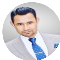
Aurangzeb Akbar aurangzeb