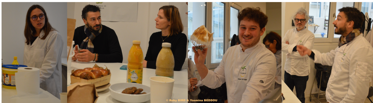
© Ruby BIRD & Yasmina BEDDOU